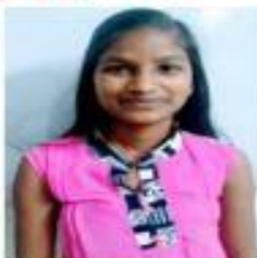
Lovely – 1 st (92%)