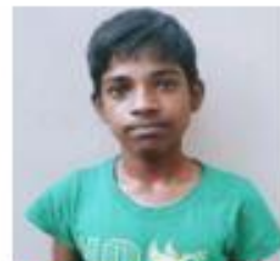
Madhir 3 rd (81%)